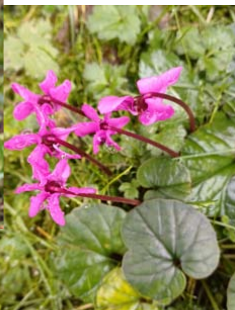
Cyclamen, The Dale