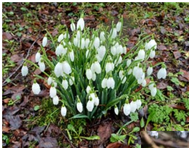
Snowdrops, St James Churchyard