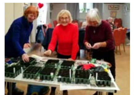
& Seed Plantings