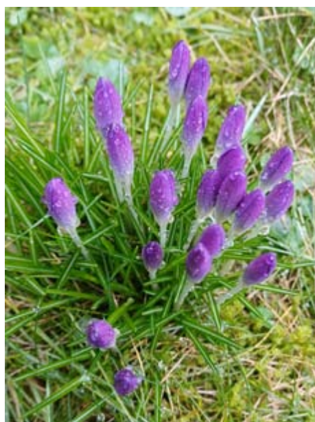
Purple Crocus, St James Churchyard