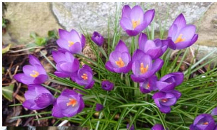
Crocus, High Street