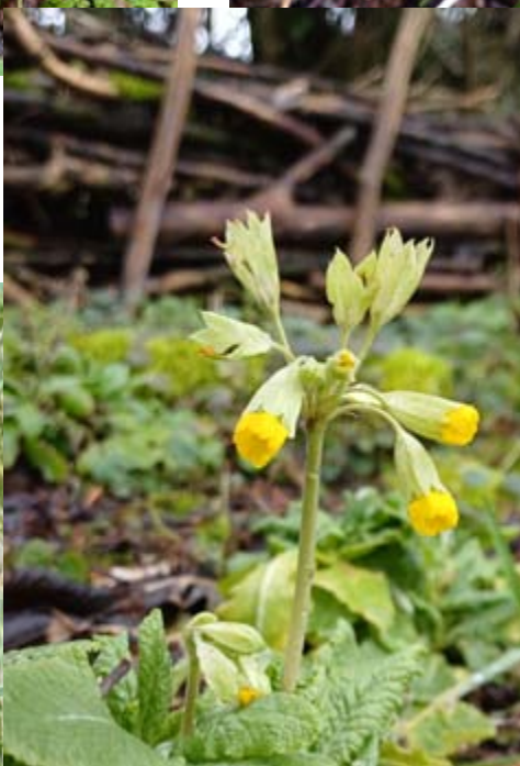
Cowslip, High Street