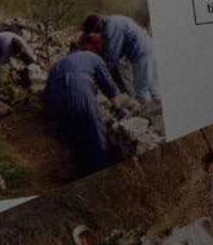
At the end of the year