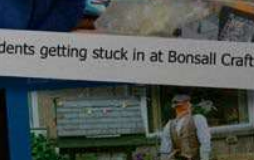
At the end of the year