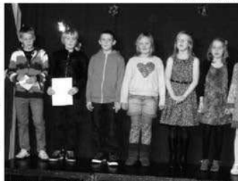
Bonsall School Children singing at the Seniors' Christmas Party