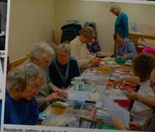
Residents getting stuck in at Bonsall Craft Club.