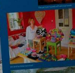
At the end of the year