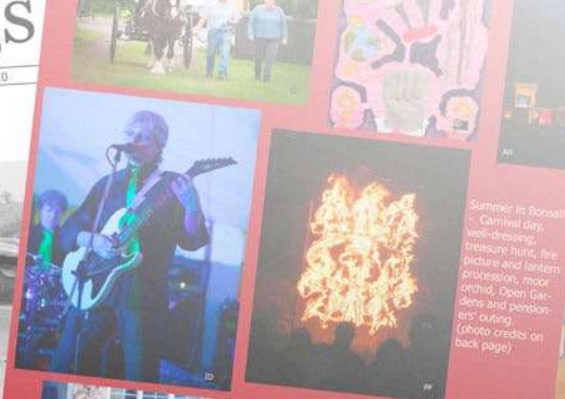
Summer in Bonsall - Carnival day, well-dressing, treasure hunt, fire picture and lantern procession, moor cricket, Open Gardens and pensioners' outing (photo credits on back page).

by firing up the bread oven and enjoying alfresco hand-made pizzas