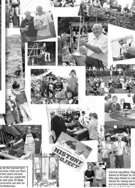
Please let the Carnival Committee know what you liked about this year's carnival day, or what you would like to see next year. All ideas and comments can also be sent to Mutterings.