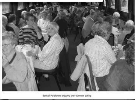
Bonsall pensioners enjoying their summer outing