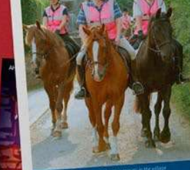
The Mayor Robert Gurney in one of 20 picture groups in the village