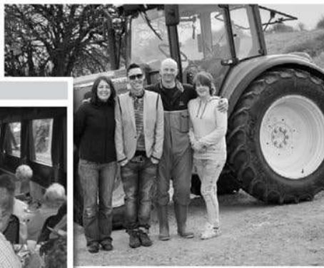
Gok Wan visits Bonsall - full story inside