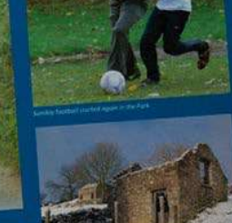
Swimming football (played again in the Park)