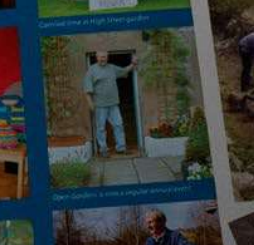
At the end of the year