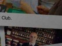
At the end of the year