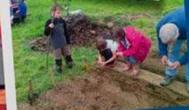
Activities continued in 2006