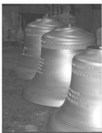
By the time you read this these magnificent structures should be installed and ready to go at St James Church. What can we say except well done to all who helped make it happen! The picture shows the bells at Eyre & Smith before despatch