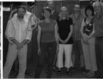
Bonsall Bellringers meeting at the Church on Sunday 10 July 2005. All churches were asked to join in and mark the occasion of 60 years after the end of World War 2 by ringing the bells at 5.00pm on that day