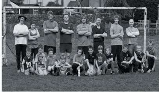
Some of the players from the Sunday side who 'turn up and make a team' pictured on a day when it wasn't actually raining. The following Sunday (probably the wettest on record) a game was played in that torrential downpour. How's that for enthusiasm! Join them...see Village Noticeboard