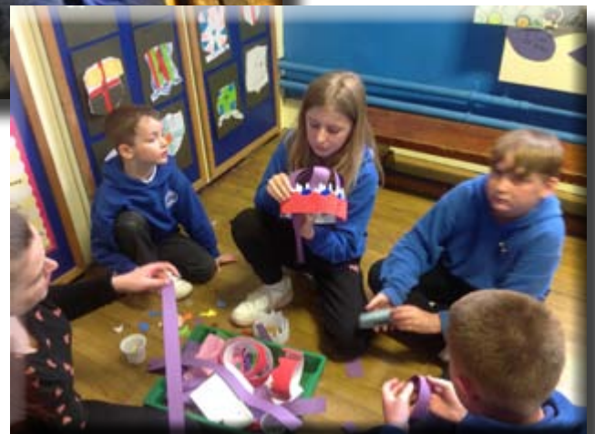
Crown Challenge - see inside