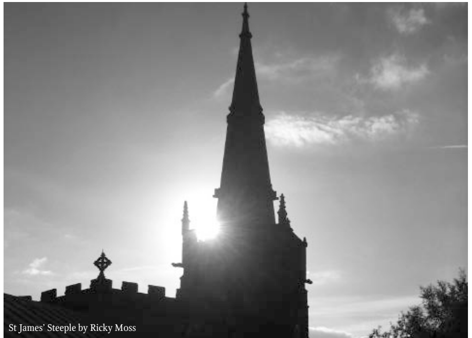
St James' Steeple