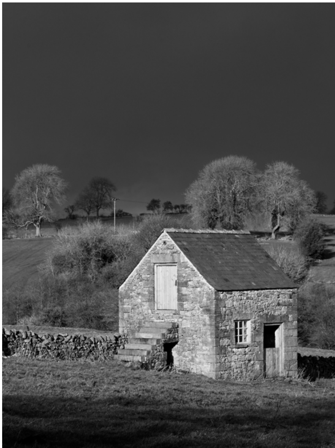
Gathering November Storm