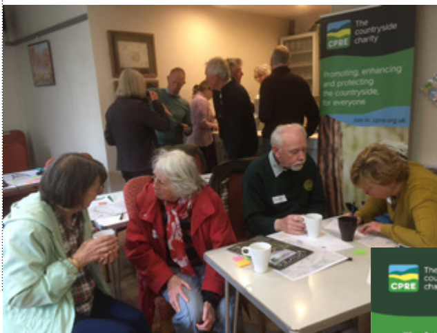
Attending the workshop and below the report cover (drawing by Christine Gregory)