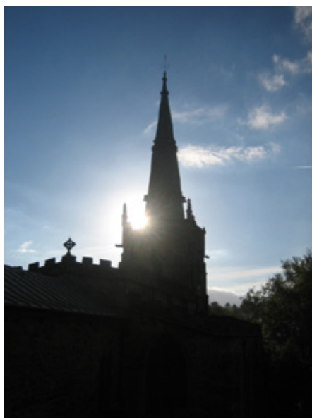
St James' Steeple

If you would like to remember someone in this way, please let me know.