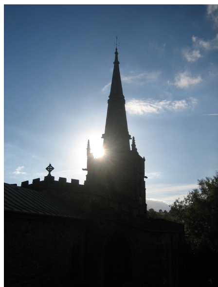
St James' Steeple