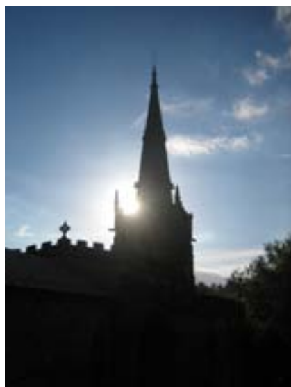
St James' Steeple