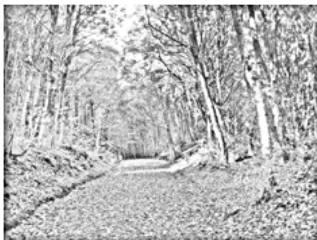
The Long Road North, based on Photo by Jeanette Moss