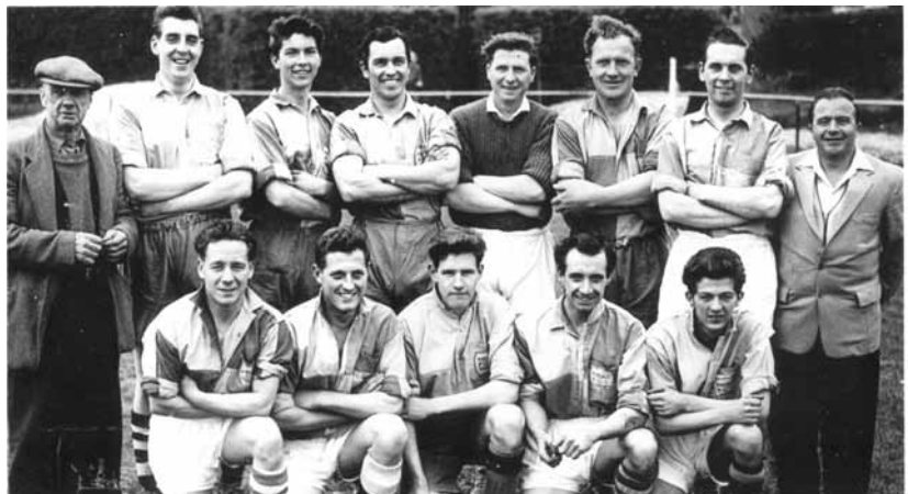
Two photos from the last book: Regulars in the Kings Head and Bonsall football team in 1961.