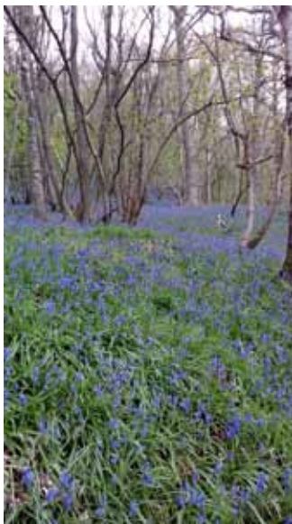
Bluebells in Clough Wood by Olive Bond