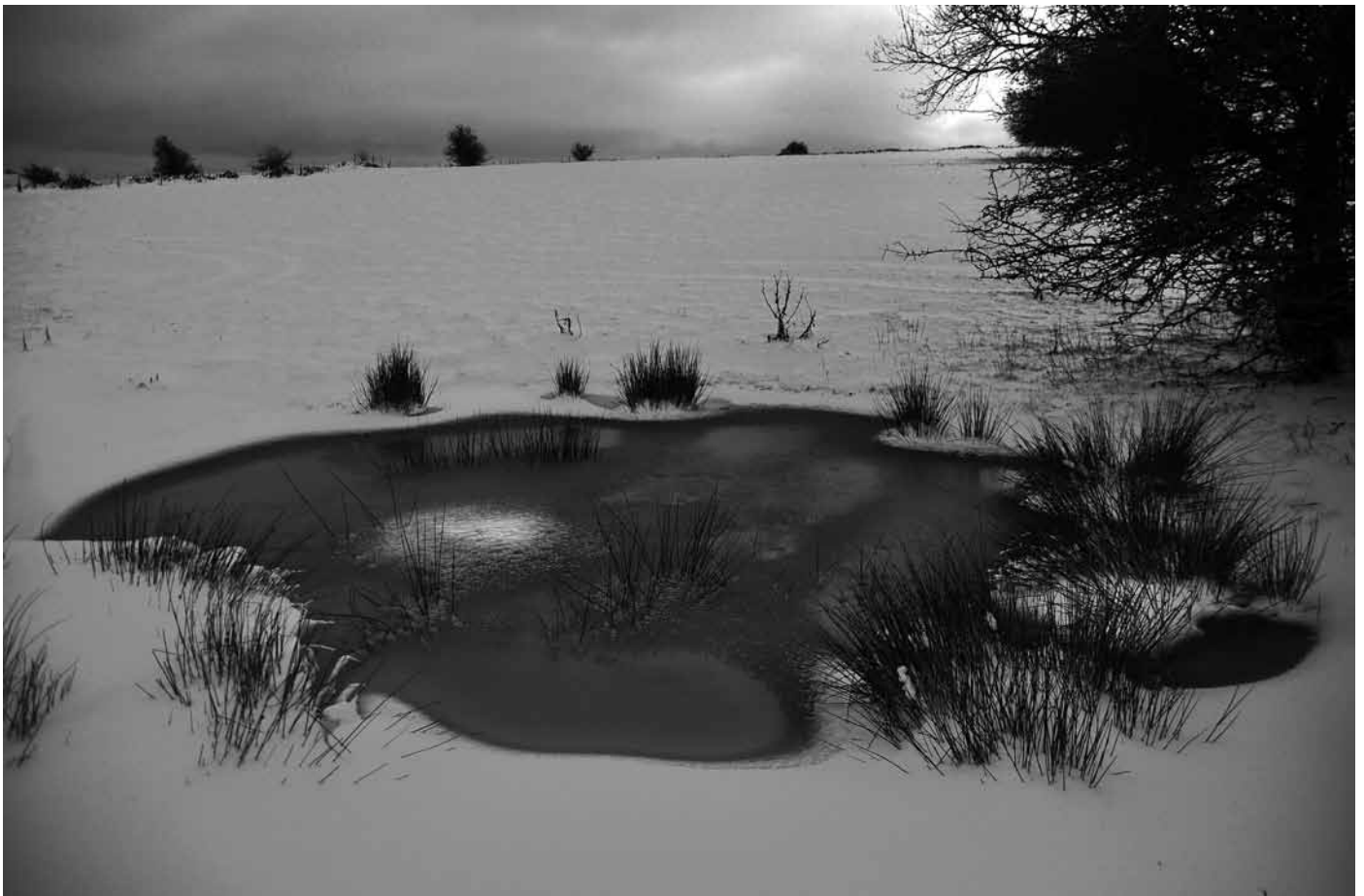
Ice and snow at the start of March. Dew Pond on Bonsall Moor.