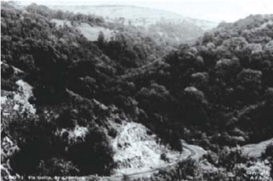
Photo caption: View of Via Gellia west of Tufa (Marl) cottage. Bonsall parish is to the left, Middleton-by-Wirksworth to the right.