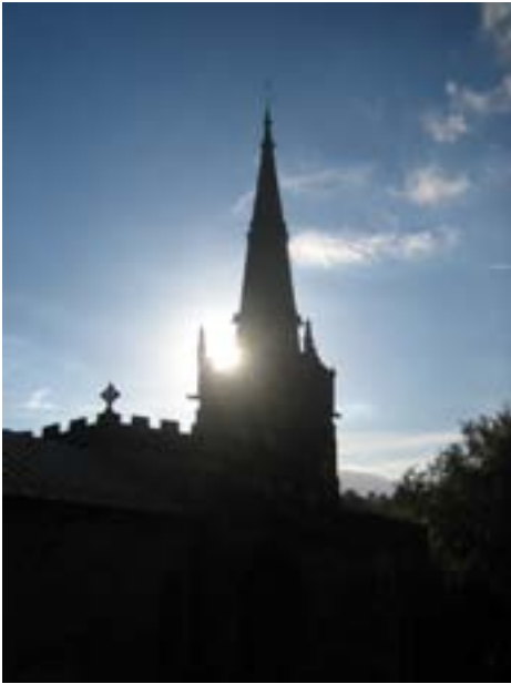
St James' Steeple