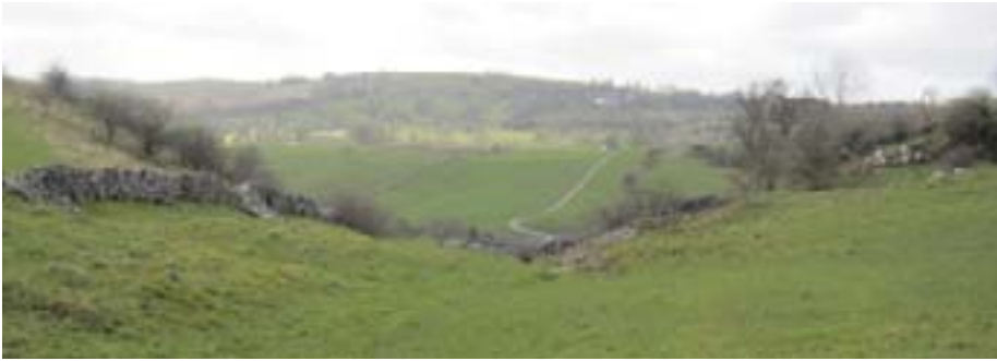
The break in the scarp utilised for funnelling livestock.

The boundary encompasses the permanent spring at Shothouse (which is the junction between Winster and Ivonbrook parishes) before rising to the scarp edge top to the west. Part way along the boundary, a natural funnel has been utilised for corralling livestock on a track linking the moor with Ivonbrook Grange buildings. Ivonbrook Grange was a dependency of Buildwas Priory and charters in 1250 show that the monks rented the pasturing of 340 sheep on Bonsall Moor.