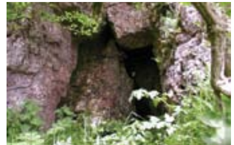
Neolithic Rock Shelter

The photo shows Long Tor crags above ground disturbed by lead mining, known as Winstar Bank, with fields down to the Bonsall-Winstar road. An outcrop of rock marks the boundary between Wensley and Winstar and is the location of a Neolithic rock shelter at an altitude of 339m (1,112 feet). There are twin entrances to a shallow single chambered cave with small fissures leading off it.