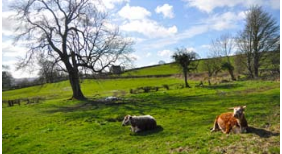
The beautiful Longhorn cattle at Four-Lane Ends. Originally bred as draught animals, they are also renowned for the butterfat content of their milk, giving good quality cheese and butter.