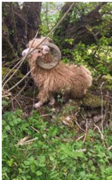
3/4 size Ram with fabric legs, card horns & fleece coat. Spotted on Salters Lane. Does anyone know the story behind this mysterious creature? Has the Derby County mascot 'Rammie' gone feral near Bonsall?