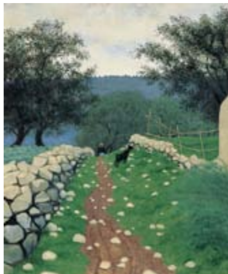
(Landscape with Goat, Vence 1924)

With the Corona virus issues moving so quickly the Open Gardens organisers have unanimously decided that Bonsall Open Gardens Weekend cannot go ahead. We are very sad about this but the health and safety of our gardeners and of the general public, is very important to us.