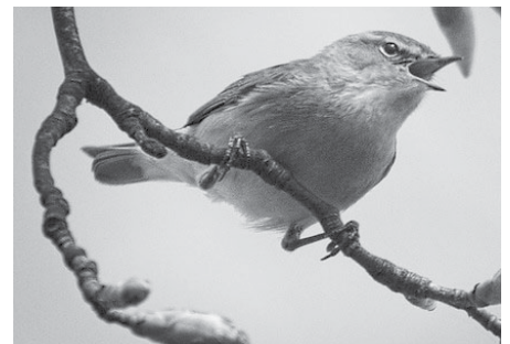
Photo of Chiffchaff