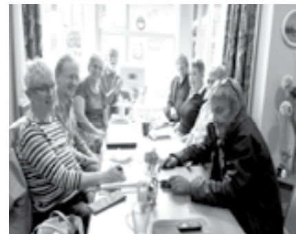
Wirksworth & District U3A Steering Group at a recent meeting

A University of the Third Age group was established in Wirksworth and District in June and is rapidly putting together a programme of activities to commence in September, with about half a dozen interest groups including gardening, Spanish language, music for pleasure, photography, walking, and hopefully more to follow. We will hold a series of monthly meetings on the first Wednesday of the month for coffee, tea and updates on progress. These will take place in the Memorial Hall between 10.15 am and 12.15 pm. All are welcome to find out about us. The chief mission of this U3A group is to reach out to neighbouring villages such as Idridgehay, Bonsall,