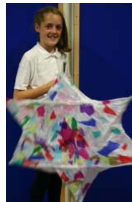
Creative lantern making