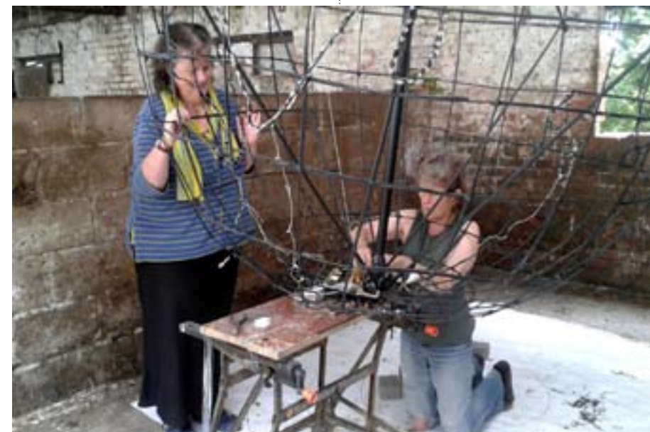
Building a planet!

YOUR FRIENDLY LOCAL TEA ROOMS, OPEN DAILY FOR BREAKFAST, LUNCH, HOT AND COLD DRINKS, CAKES ETC.