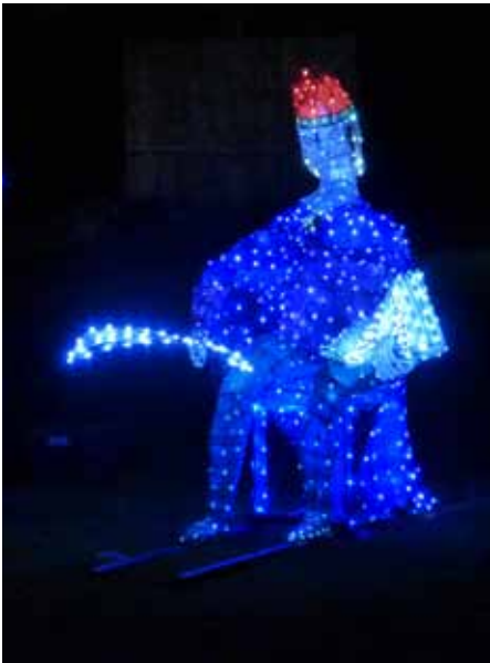
Some reminders of last year's Carnival and well dressings