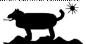
Illustration by Thomas Curson