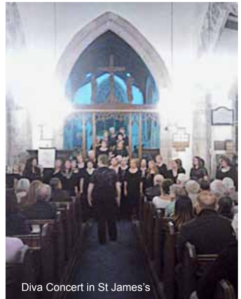
Diva Concert in St James's

Every year we try to find entertainment that people will enjoy, or that is different from previous years. We have had popular acts back, but it can be hard to find entertainers, so if you do see an act or an idea elsewhere that you think would go down well at the Carnival, just get a contact number or email address and pass on to a carnival member. Look forward to new ideas.