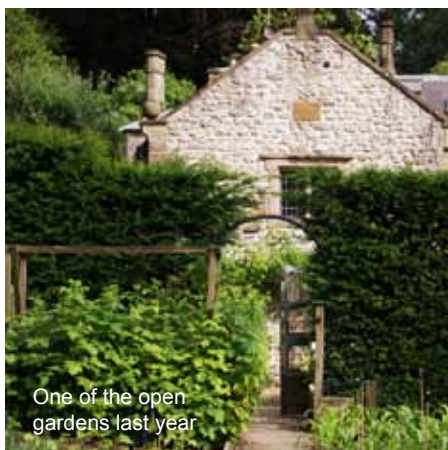
One of the open gardens last year